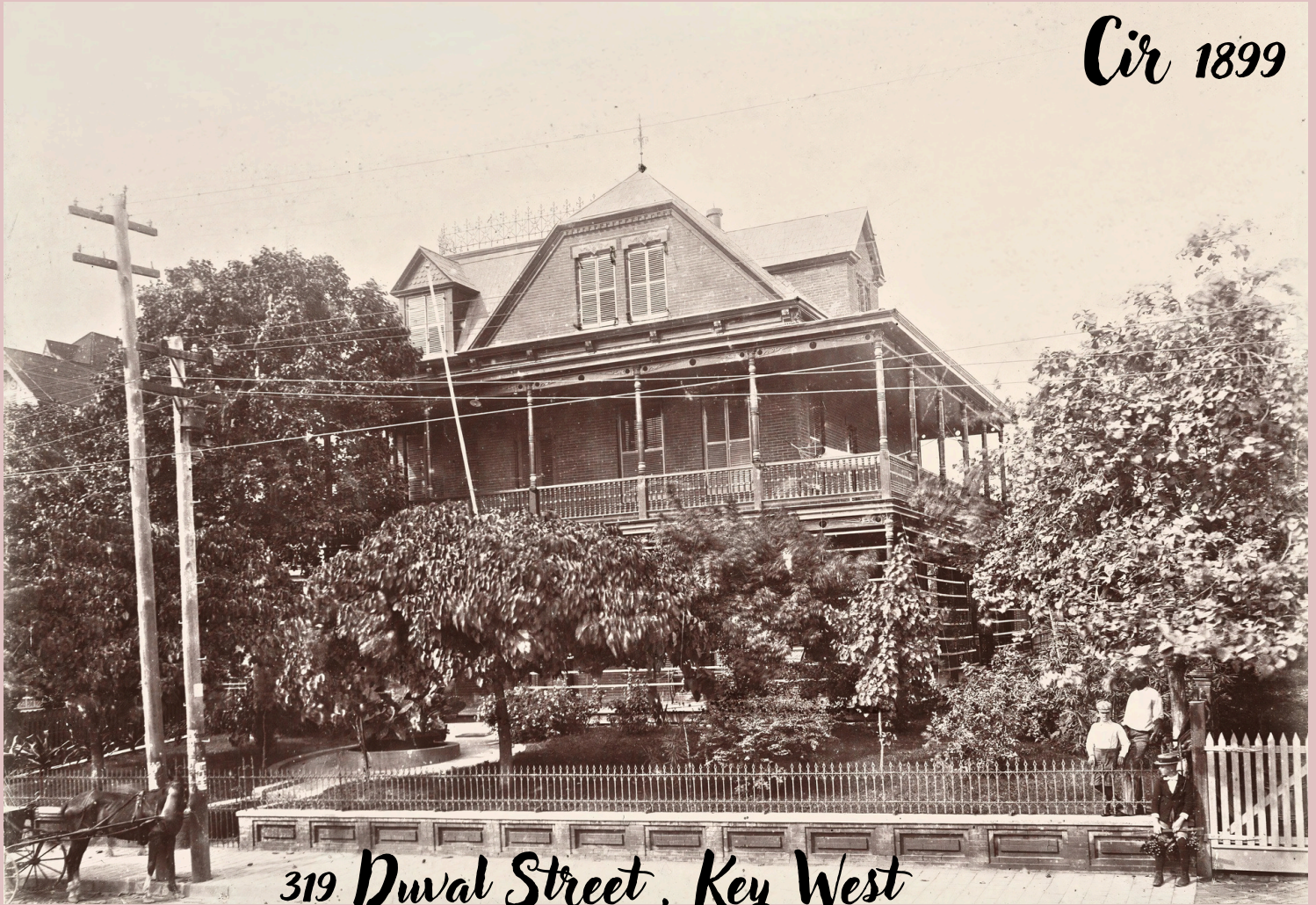
319 Duval Street, Key West